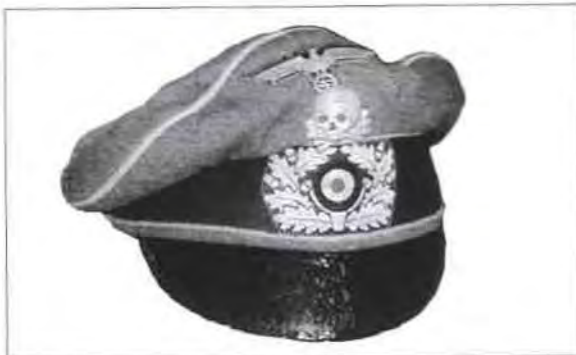
A fine, rare example of a cavalry officer's 'crusher' cap. It features cavalry golden-yellow piping and the metal death's-head emblem worn by Kavallerie-Regiment 5; cf Plate F. (Francois Saez)

the cockade in national colours, was regularly worn by Leutnant Otto Carius, a Tiger 'ace' from schwere Panzer-Abteilung 502.