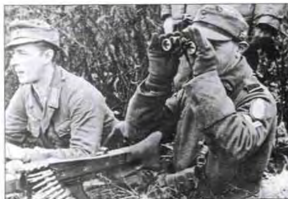
Men of 3. Gebirgs-Division on the Eastern Front in 1942; the Obergefreiter with the binoculars is a veteran of the battle for Narvik as evidenced by the Narvik Shield on the left sleeve of his greatcoat. Note the Edelweiss badge on the left side of the short-visored Bergmützen caps.

The most significant piece of insignia pertinent to this division was the special Narvik campaign shield worn on the left sleeve. This award was instituted on 19 August 1940 and took the form of a silvered metal shield topped by an eagle and swastika and the legend 'Narvik'. On the shield were depicted a propeller (for the Luftwaffe), an anchor (for the Navy) and an Edelweiss (for the Gebirgsjäger), symbolising the combined effort made by all three services in the battle of Narvik. 5