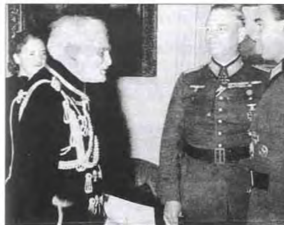
An example of the new Feldmarschall v. Mackensen cuffband was presented to the field-marshal on the occasion of his 95th birthday on 6 December 1944 by General-feldmarschall Keitel, attended by an officer, an NCO and an enlisted man of Kavallerie-Regiment 5.

including Kavallerie-Regiment 5 – in the last weeks of the war. This was an entirely unofficial insignia, and judging by the relative crudity of surviving examples it seems to have been made up by local 'cottage industry' facilities rather than being commissioned from a trade manufacturer. It consists of a yellow woollen shield with a black border, upon which two opposed horses' heads are worked in black. 3