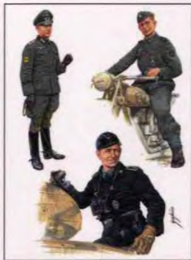
Full colour artwork

The uniforms, equipment, history and organisation of the world's military forces, past and present.