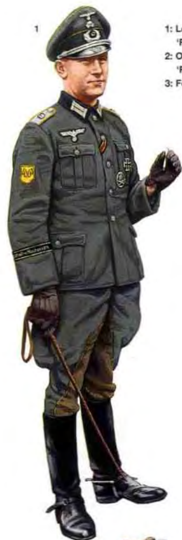
1: Leutnant, Kav-Regt 5 'Feldmarschall von Mackensen', 1945 2: Oberreiter, Kav-Regt 5 'Feldmarschall von Mackensen', 1945 3: Feldwebel, Pz-Regt 24, 24. Pz-Div, 1943