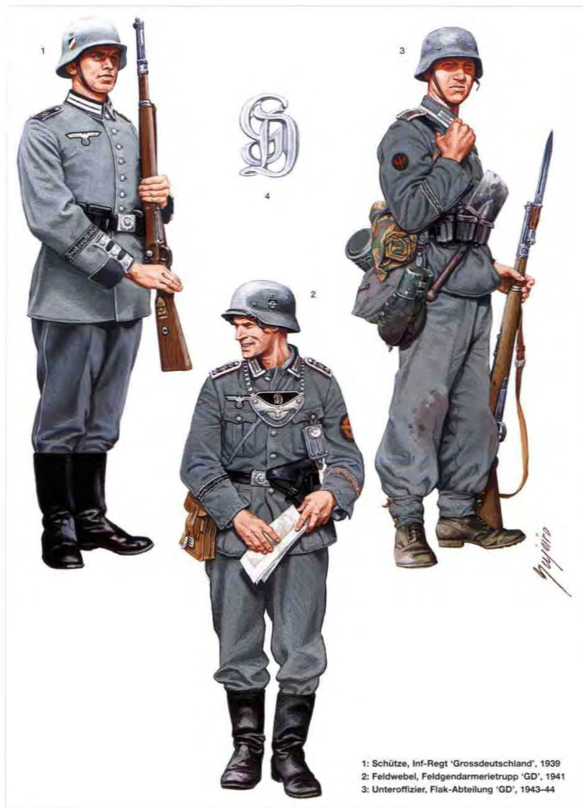
1: Schütze, Inf-Regt 'Grossdeutschland', 1939 2: Feldwebel, Feldgendarmetrupp 'GD', 1941 3: Unteroffizier, Flak-Abteilung 'GD', 1943-44