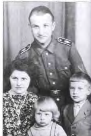
A Gefreiter from Panzergrenadier-Regiment 'Grossdeutschland 2' with his wife and young children. Note the shoulder straps with the small numeral '2' just below the 'GD' cipher; this rare strap type was only worn for a short period in 1942-43.

Initially a bodyguard unit for Hitler, it was expanded into an armoured brigade in November 1944. It too was used in the abortive Ardennes offensive before being thrown into defensive actions in East Prussia, after being expanded yet again to divisional status. Fighting around Vienna towards the end of the war, it was almost totally wiped out in