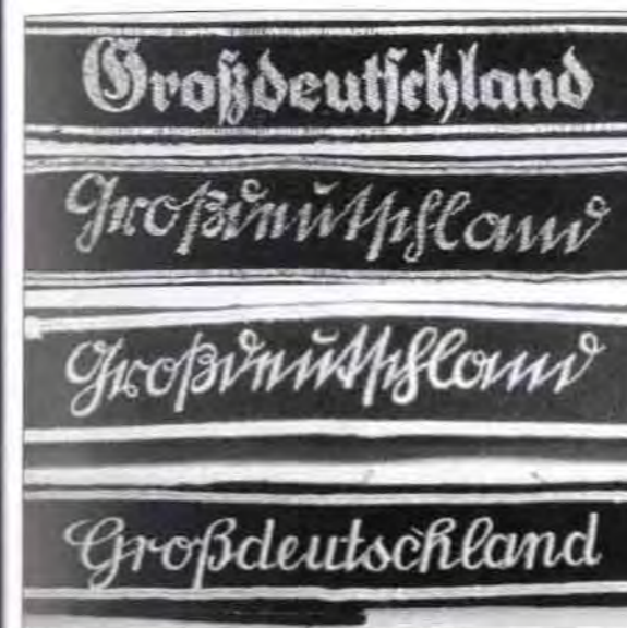
'Grossdeutschland' cuffbands - from top to bottom: First pattern, machine-woven in aluminium thread Gothic script on dark green rayon. Third pattern, hand-embroidered in aluminium wire Sütterlin script on black doeskin. Fourth pattern, machine-embroidered in silver-grey yarn on black wool. Fifth pattern, machine-embroidered in 'copperplate' script on black wool.