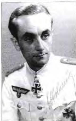
Leutnant Otto Carius, commander of 2 Kompanie/ schwere Panzer-Abteilung 502, wearing an optional private purchase white summer tunic. This photo was taken while he was still recuperating from wounds received in the action for which he was decorated with the Oakleaves to his Knight's Cross – cf Plate E. He was shot five times while carrying out a reconnaissance on foot, but recovered to return to front-line duty.

sPz-Abt 501 was disbanded and used to form the new sPz-Abt 424, which was attached to XXIV Panzerkorps; this was little more than a renaming exercise, as the unit remained in the same sector of the front under the same commander. The battalion was finally completely disbanded in February 1945.