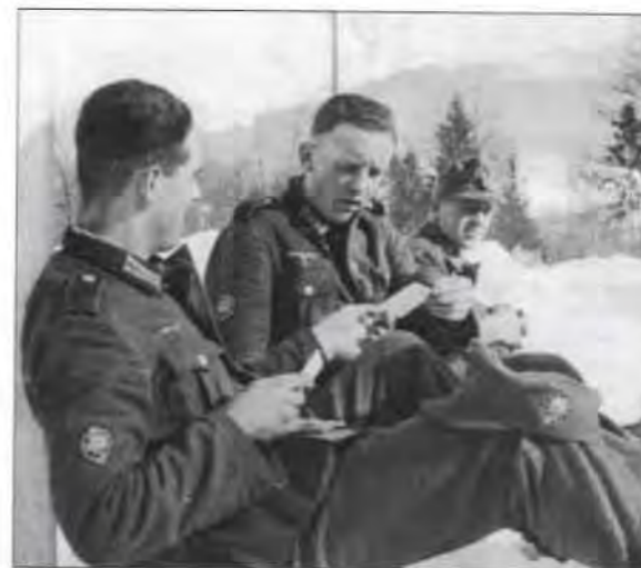
Gebirgsjäger relaxing – cf Plate H. Note the Edelweiss sleeve patch, and the metal badge worn on the side of the Bergmütze. (Ian Jewison)

This junior NCO of Gebirgsjäger proudly displays on his left sleeve the Kreta cuffband commemorating his service during the hard-fought invasion of Crete in May 1941. On the left side of his Bergmütze, just ahead of the Mountain Troops' regulation Edelweiss badge, is pinned the 'Gams' – the semi-official divisional badge adopted by 5. Gebirgs-Division, in the shape of a small white metal chamois on a mountain peak. His tunic is the M1943 Feldbluse, with plain field-grey collar and subdued collar patches; Waffenfarbe piping appears only around the field-grey shoulder straps. Both the rankers on this plate wear conventional black leather equipment and carry the 98K rifle.