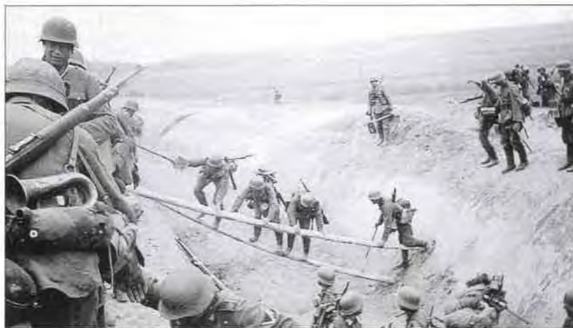
Soldiers from Infanterie-Regiment 'List' crossing an anti-tank ditch during the advance through Soviet Russia; none appear to wear the cuffband on their combat uniforms. Note, however, that the company bugler at left does carry his instrument in the field.