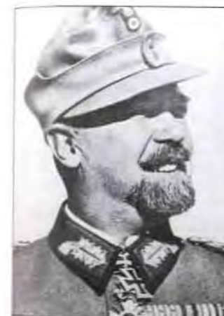
General der Gebirgstruppe Julius Ringel, commander of 5. Gebirgs-Division during the battle for Crete. A popular and instantly recognisable figure, 'Papa' Ringel invariably sported a moustache and goatee beard.

At first glance this soldier wearing the short M1944 'battledress' blouse with tapered trousers, ankle boots and canvas gaiters is fairly typical for a Panzergrenadier at this late stage of the war. What sets him apart are the 'FG' cipher embroidered in grass-green Waffenfarbe into his shoulder straps, and the Grossdeutschland cuffband worn on his right sleeve; this combination of insignia identifies him as a member of the short-lived Führer-Grenadier-Division. The 'FG' straps were only worn for a short period and are extremely rare. He carries a semi-automatic Kar 43 rifle and wears its canvas magazine pouches on late war webbing equipment; and his M1942 helmet has a makeshift chickenwire cover for attaching camouflage.