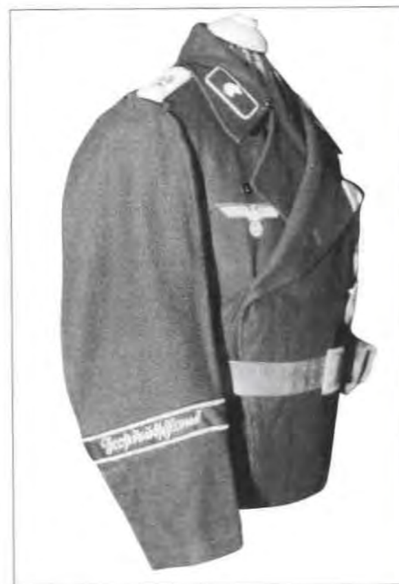
The unique jacket worn by armoured personnel serving with the Führer-Begleit-Brigade at Hitler's headquarters; cf Plate G1. The piping to collar patches and shoulder straps was white rather than the traditional rose-pink of the armoured troops. On the left sleeve is worn the cuffband Führerhauptquartier , and on the right Grossdeutschland . (Chris Boonzaier)

This NCO serving at Führer Headquarters wears a unique combination of insignia. As a member of an armoured unit he wears the black Panzer uniform, but with white rather than pink piping to his shoulder straps, collar, collar patches and as a soutache on his field cap. He has white metal 'GD' ciphers on his shoulder straps; on his right sleeve is the Grossdeutschland cuffband, and on his left the cuffband Führerhauptquartier worn by personnel actually on duty at Hitler's headquarters. This unusual combination is known from a handful of surviving examples of this jacket and a few rare wartime photos.