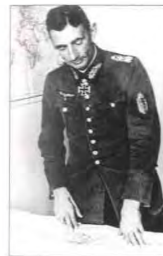
General Eduard Dietl , the 'Hero of Narvik' and commander of 3. Gebirgs-Division, after the award of the Oakleaves to his Knight's Cross. He wears the Narvik Shield on his upper left sleeve. See Plate H2.