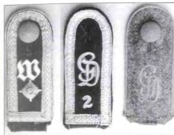
(Left) The special shoulder strap for those serving with the guard detachment in Berlin; in this case the rank is Feldwebel. The 'W' was embroidered for enlisted ranks, in white metal for senior NCOs and gilt metal for officers. (Centre) A rare shoulder strap from Panzergrenadier-Regiment 'Grossdeutschland 2', for the rank of Unterfeldwebel. (Right) Piping and embroidered cipher in orange on a field-grey strap for a member of the 'GD' divisional Feldgendarmerie troop.

The Flak-Abteilung 'Grossdeutschland' introduced, some time in 1943, a unique identifying sleeve badge consisting of a winged Flak shell,