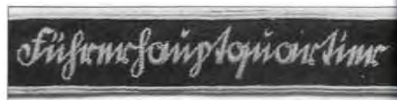
The Führerhauptquartier cuffband, hand-embroidered in aluminium thread Sütterlin script on a black doeskin base. It was worn on the lower left sleeve by all troops during their attachment to Hitler's headquarters, e.g. the Führer-Begleit-Brigade drawn from 'GD' personnel.

actions against the Red Army near Spremberg. Those members of the brigade actually on duty at Hitler's headquarters wore a cuffband in black with the legend Führerhauptquartier in silver; others used the standard Grossdeutschland cuffband. The standard 'GD' shoulder strap ciphers were used by this unit.