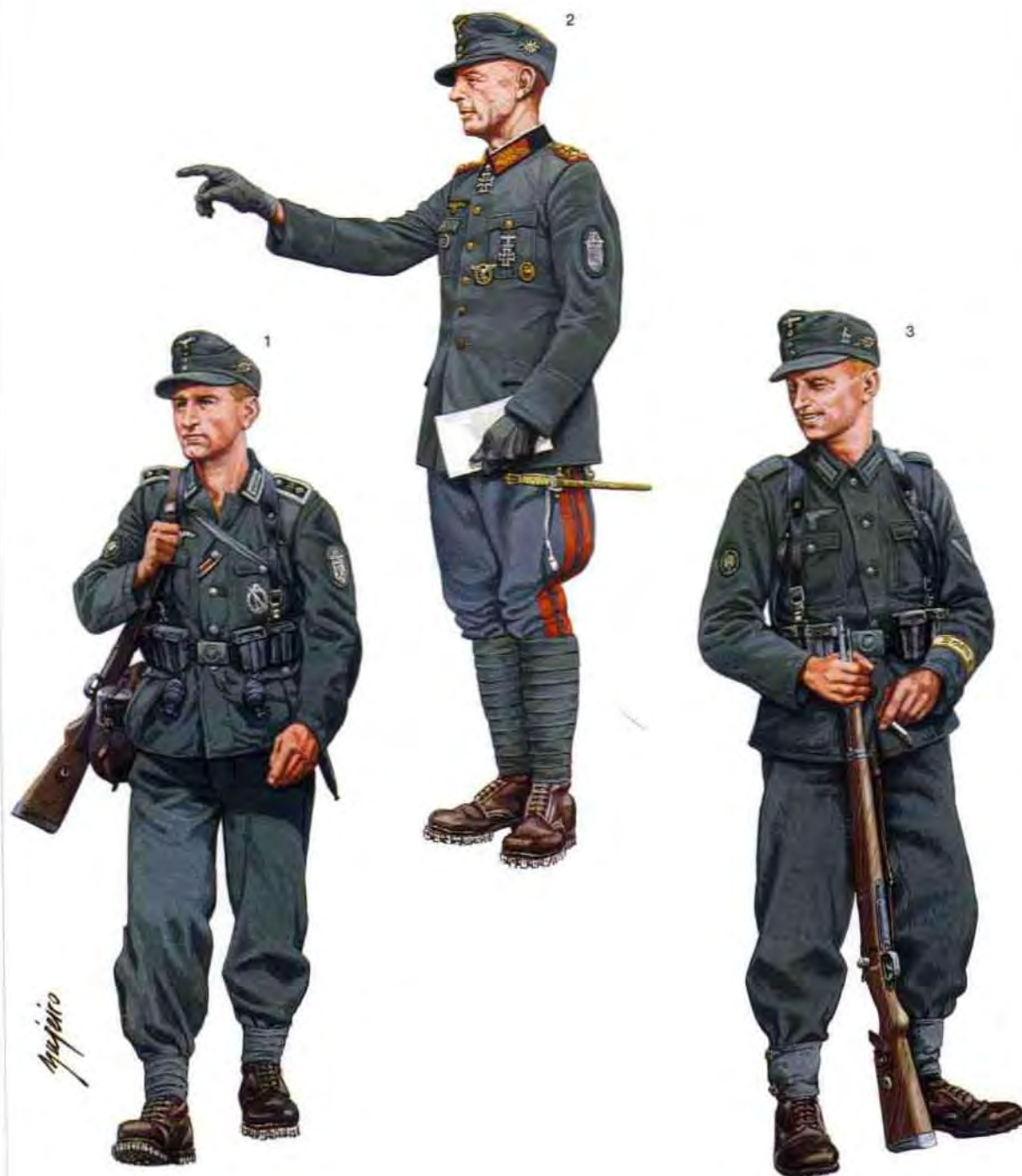
1: Feldwebel, Gebirgsjäger-Regt 138, 3. Gebirgs-Div, c.1942 2: Generaloberst Eduard Dietl, 1943 3: Gefreiter, 5. Gebirgs-Div, 1943