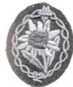
TOP The Narvik Shield, issued in silver (actually light grey zinc) for the Luftwaffe and Army and gold for the Navy. In the case of awards to Gebirgsjäger, as here, it is mounted on a piece of field-grey backing cloth for stitching to the uniform sleeve. ABOVE The Mountain Troops' Edelweiss sleeve patch in a hand-embroidered officer's quality example using aluminium and gold-coloured wire.

The divisional personnel naturally also wore the special Edelweiss insignia which identified all mountain units. The right sleeve patch consisted of a white Edelweiss flower with yellow stamens and green stem, set within a silver-grey twisted rope border with a piton at its top. This was made in both machine-embroidered and woven forms for lower ranks, and occasionally in hand-embroidered bullion thread for officers. The standard metal Edelweiss emblem was also worn on the left side of the Bergmütze.