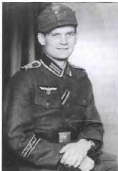
ABOVE This Feldwebel from the 'Grossdeutschland' Division is pictured during an attachment to the Wachregiment in Berlin. He retains his divisional cuffband but for the period of his attachment wears the Gothic 'W' cipher on his shoulder straps.