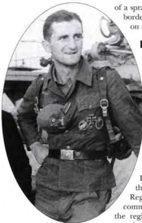
A member of a Brandenburg commando unit involved in the capture of the island of Cos in early 1944. He wears Army lightweight tropical field dress, with the peaked field cap thrust into the front of his tunic. Note, however, the rare Army parachutist's badge on his left breast pocket. By this stage in the war Brandenburgers were the only servicemen being awarded this Army paratroop qualification badge. (Mike Bischoff)

of a spray of three pale green oakleaves within a pale grey rope-effect border, all on a dark green, or later field-grey patch. This was worn on the upper right sleeve.