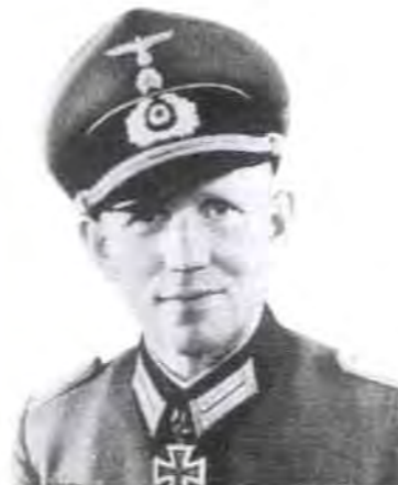
An unidentified Knight's Cross winner with the death's-head tradition badge as worn by Kavallerie-Regiment 5 in his cap. The design of the death's-head varied; this one seems to be the standard pattern as used on Panzer collar patches.

A cuffband was introduced for Kavallerie-Regiment 5 on 6 December 1944, the occasion of Field Marshal von Mackensen's 95th birthday. An example of it was presented to him at Erbhof Brüssow in Pomerania in a special ceremony attended by Generalfeldmarschall Keitel from the Oberkommando der Wehrmacht, and also by an officer, an NCO and a Gefreiter from the regiment. It had been doubted that cuffbands apart from this special presentation piece were ever issued; but rare wartime photographs show several members of the unit, including the regimental